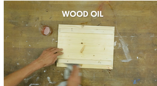
8. Treat everything with organic wood oil.