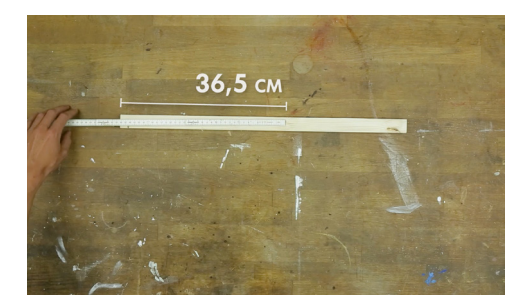
2. Draw marks on the strips at 36,5 cm from one side.