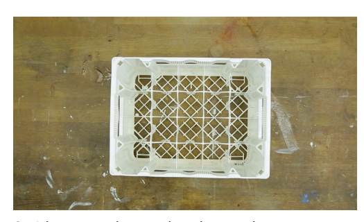
9. Wham - put the wooden plate on the crate.