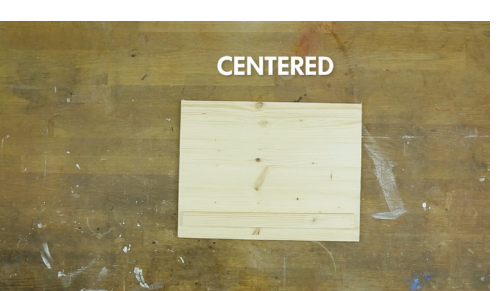
5. Place the strips right above the marks.