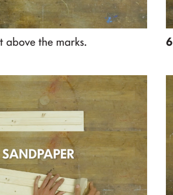
7. Sandpaper the edges.