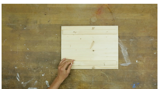
6. Fix the strips with screws.