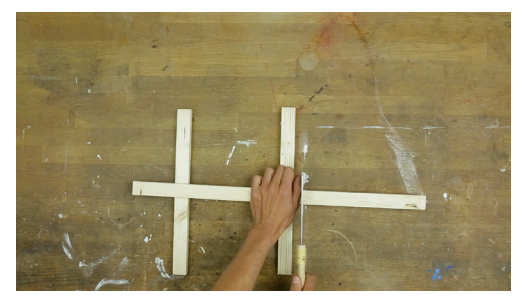
3. Cut the wooden strips down to those 36,5 cm with the saw.