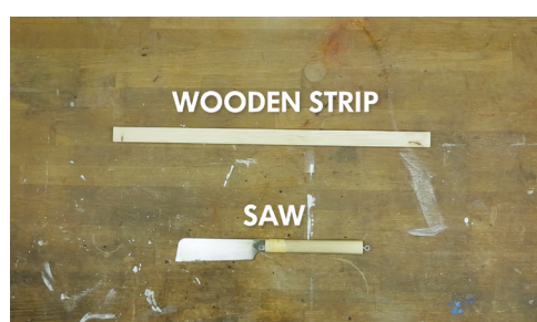
1. Start with the wooden strips and the saw.