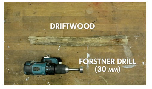
1. Start with the driftwood and the forstner drill (30 mm).

6. Now take the string and the two screw eyes.