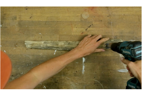
2. Drill 6 holes next to each other into the wood.