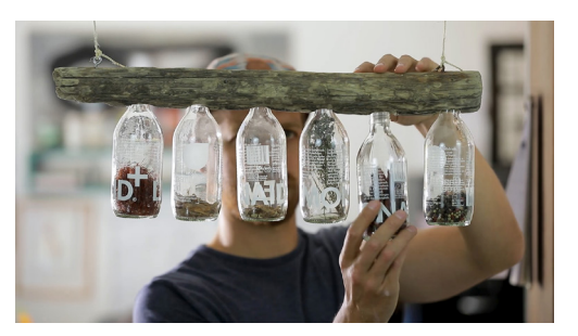
9. Fill the bottles with spices and screw them into the screw caps.