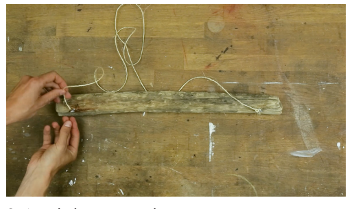
8. Attach the string to the screw eyes.

7. Fix the screw eyes at the two ends of the wood.