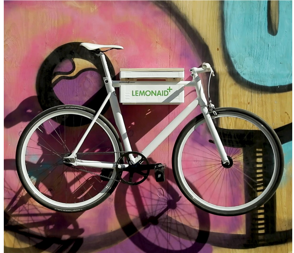
13. Now just fix the rack to the wall with screws, hang up the bike - that's it!