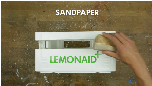
11. Sandpaper the edges.