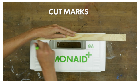
2. Draw a horizontal saw line on the front above and below the handle hole.