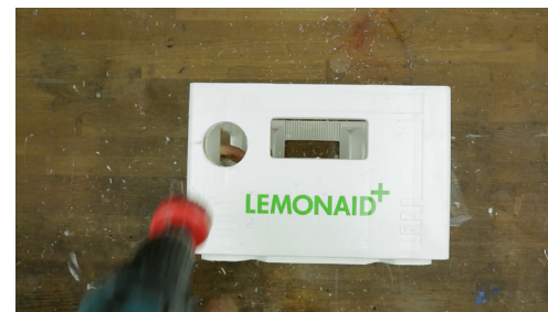
7. ... and the right side.