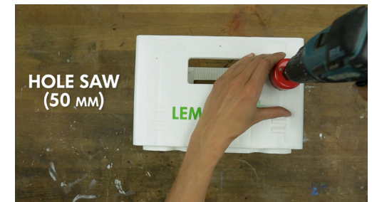
6. Drill a 50 mm wide hole with the hole saw at the intersection of the markings on the left side...