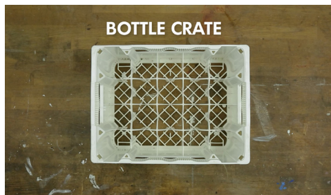
1. Take the empty Lemonaid box first.