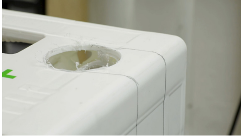
9. ... which connect to the respective lines on the front.