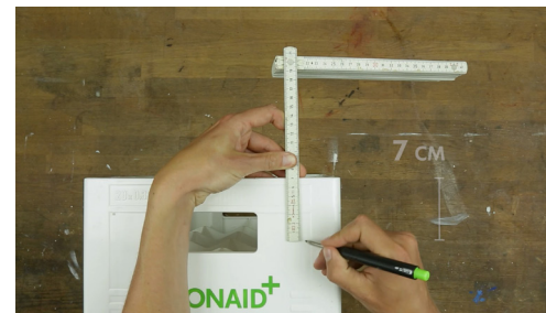
5. Do the same on the left side of the box.