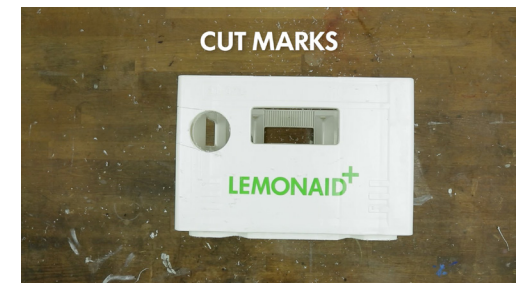
8. Now draw saw lines on the upper and lower sides of the holes,...