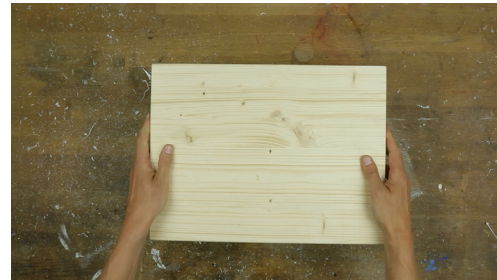
12. Put the wooden plate (see our "DIY Stool" tutorial) on the crate.