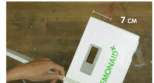
4. ... and 7 cm from the top..